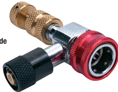
Item# C52803 Purge-Mate High-Side Valve Core Remover without Side Port