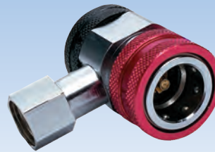
Item# C52701 R-134a Purge-Mate High-Side Coupler without Purge Button.