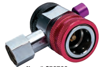
Item# C52703 R-134a Purge-Mate High-Side Coupler with Purge Button. Simply push the button to purge air.