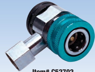
Item# C52702 R-134a Purge-Mate Low-Side Coupler without Purge Button.