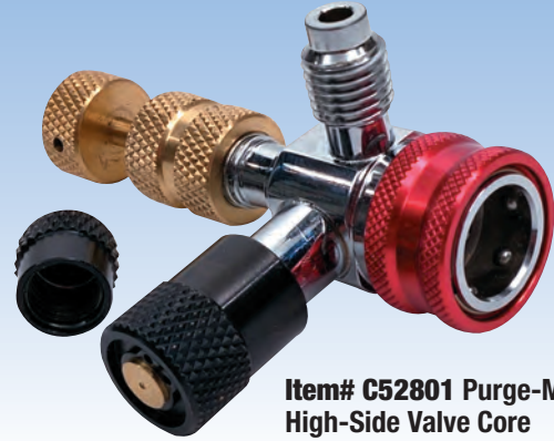
Item# C52801 Purge-Mate High-Side Valve Core Remover with Side Port

One look at the our line of PURGE-MATE Valve Core Removal Tools will convince you that you're looking at something special. Not only have they been designed to take less space than existing tools, but they look great too. But the real beauty lies in their use. Shafts that move smoothly, grips that take a clean, firm grip on your valves. Handles that feel just right. As with all PURGE-MATE tools that couple to a service port, look for the special 8-ball connection for added grip and stability.