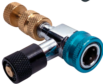
Item# C52804 Purge-Mate Low-Side Valve Core Remover without Side Port

Your choice of high-side or low side valve core removers, either with or without the optional side port. Our top-of-the-line valve core removers feature the side port allowing work on a charged system without the need for evacuation. Just stay hooked up on the side port to your manifold or R&R machine while removing a faulty or damaged valve core. No loss of refrigerant, no pressure loss. Also use the side port for temporary removal of valve cores. By removing the "restriction" of the valve core, you get the full flow of refrigerant during recovery, evacuation and recharge. This saves valuable service time.