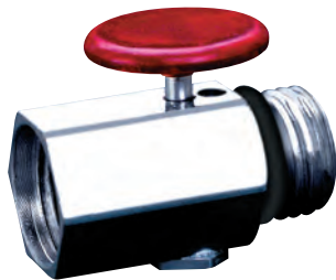
Item# C52503 14mm Purge-Mate Fitting