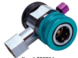
Item# C52704 R-134a Purge-Mate Low-Side Coupler with Purge Button. Simply push the button to purge air.