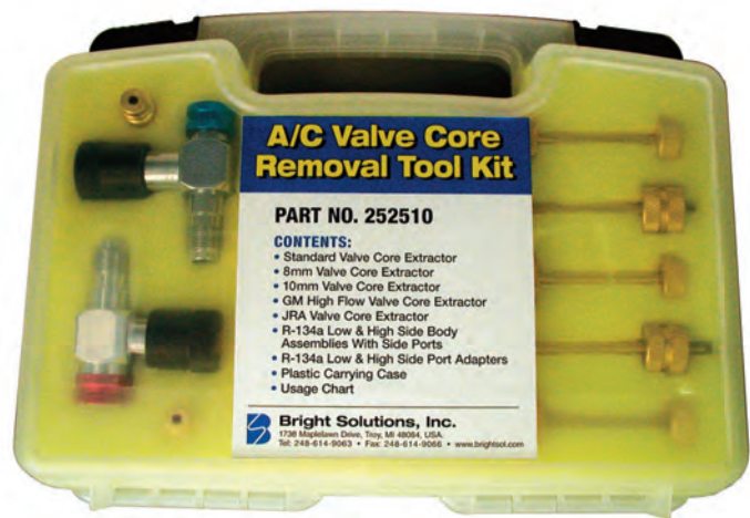
Item# 252510 A/C Valve Core Removal Tool Kit

252510 A/C Valve Core Removal Tool Kit Includes: Extractors For Standard Valve Cores, 8 Mm Valve Cores, 10 Mm Valve Cores, GM High Flow Valve Cores, & JRA Valve Cores, R-134a Low- & High-Side Body Assemblies with Side Ports, R-134a Low & High-Side Port Adapters, Plastic Carrying Case with Usage Chart & See-Through Lid