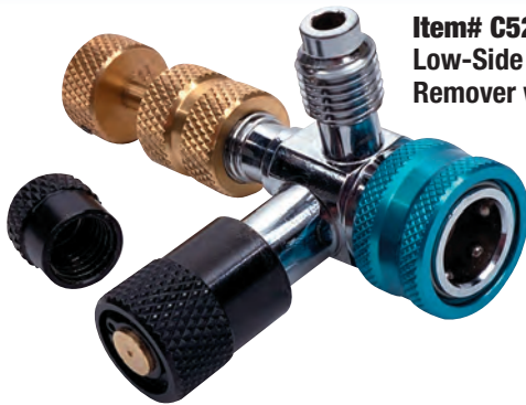
Item# C52802 Purge-Mate Low-Side Valve Core Remover with Side Port